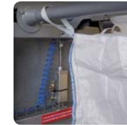
▶ Tension cylinder insures a perfect big bag filling and handling stability