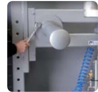
▶ Hooking forks width adjustment allows conditioning of all types of big bags