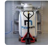
▶ Big bag removal with fork or pallet truck