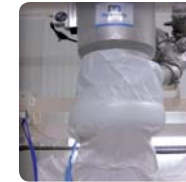
▶ Inflating seal to insure dust containment for a clean work area