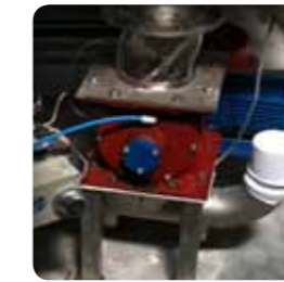
Robust compact design for a longer lifetime